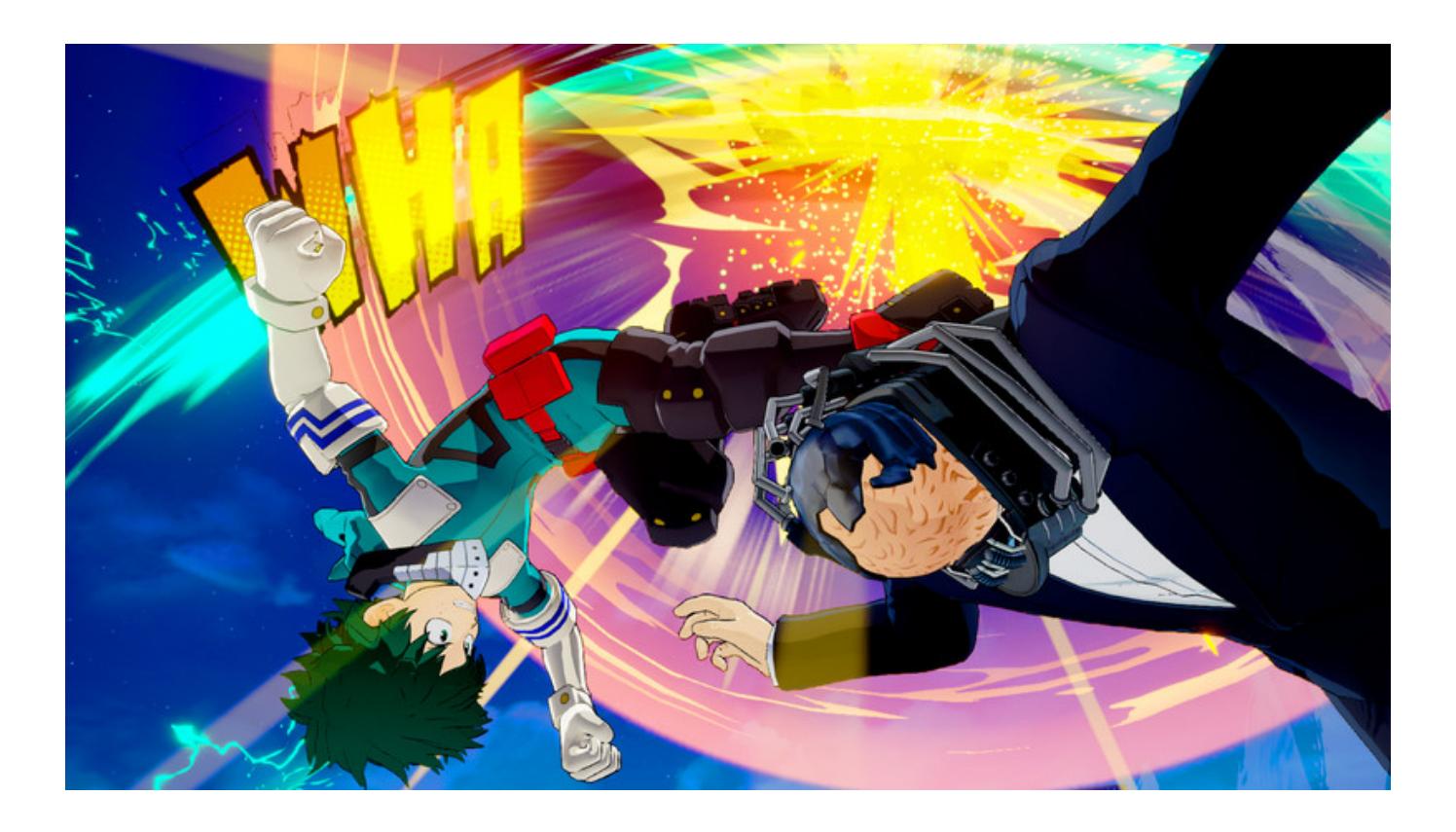
MY HERO ONE'S JUSTICE Mission: O.F.A Deku Shoot Style Download For PS4

Download ->>->> <a href="http://bit.ly/2NLJ3eS">http://bit.ly/2NLJ3eS</a>